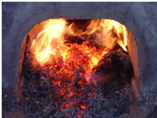
Ash buildup in a pellet boiler.

Ash is more than an issue of convenience for the user. The composition and quantity of combustion residue are the primary factors determining whether or not a feedstock can be burned effectively in a particular appliance. It is possible to significantly change both the composition and quantity of ash in grasses through management. Grass breeding and selection for increased yield has been ongoing for decades, while there has been essentially no breeding in grasses for changes in ash composition to improve combustion efficiency. A long-term breeding effort would likely be necessary to change ash composition and improvements likely would be quite modest.