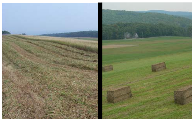
Reed canarygrass cut in August and baled in September in New York State.

Fertility management. Yield of perennial cool-season grasses does not respond greatly to K fertilization in the Northeast. Avoiding KCl fertilization will minimize K and Cl in grass. Grasses will need some N fertilization for optimum yields.